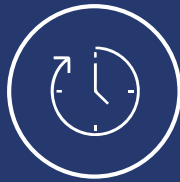
Half Hourly Metering