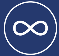
Automatic Switching Service